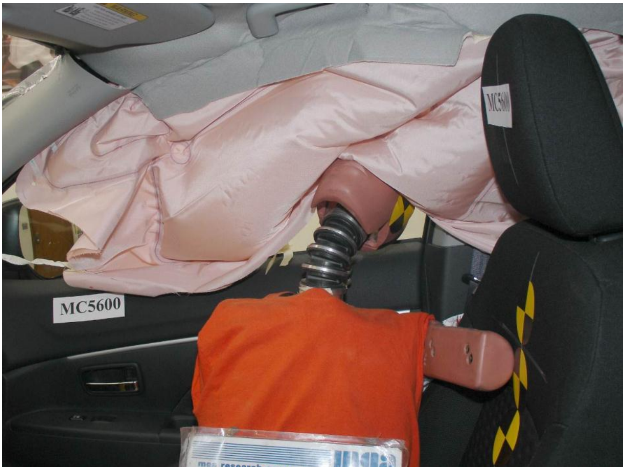
Post-Test SID-IIs Dummy Left Side Closeup View