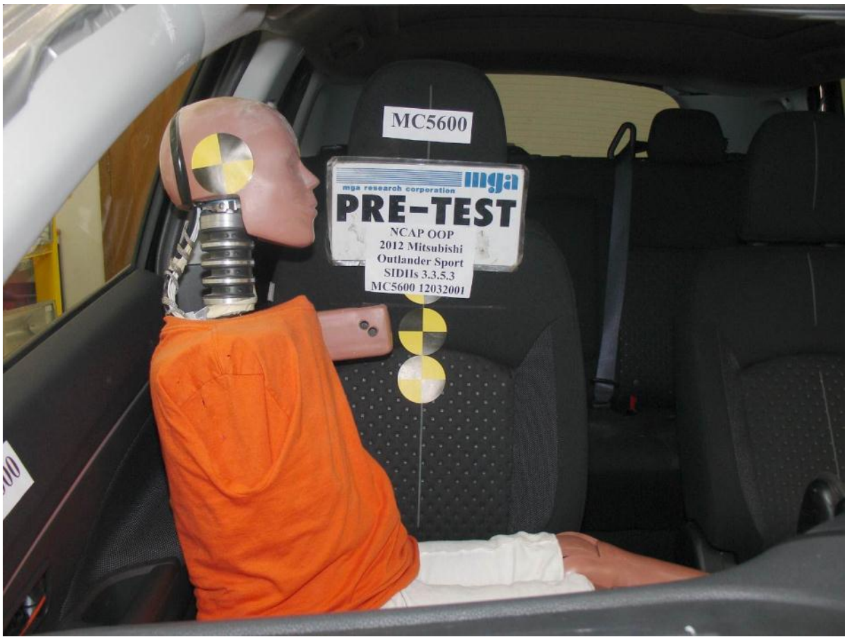
Pre-Test SID-IIs Dummy Front View