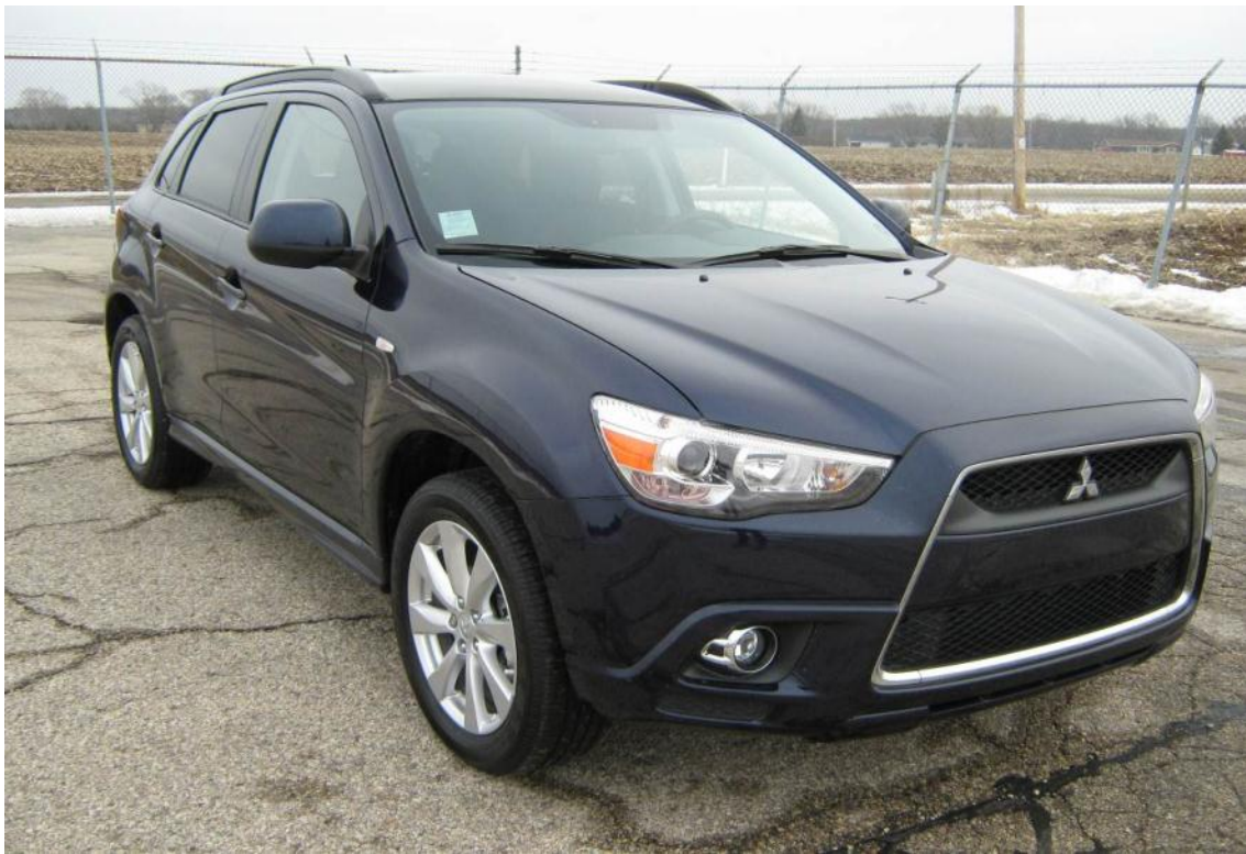
Right 3/4 Front View of Vehicle, As Received