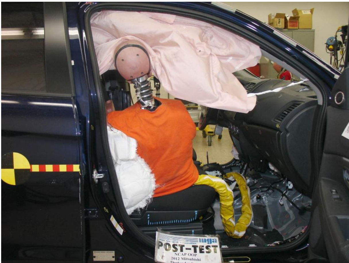
Post-Test SID-II's Dummy Right Side View (Door Open)