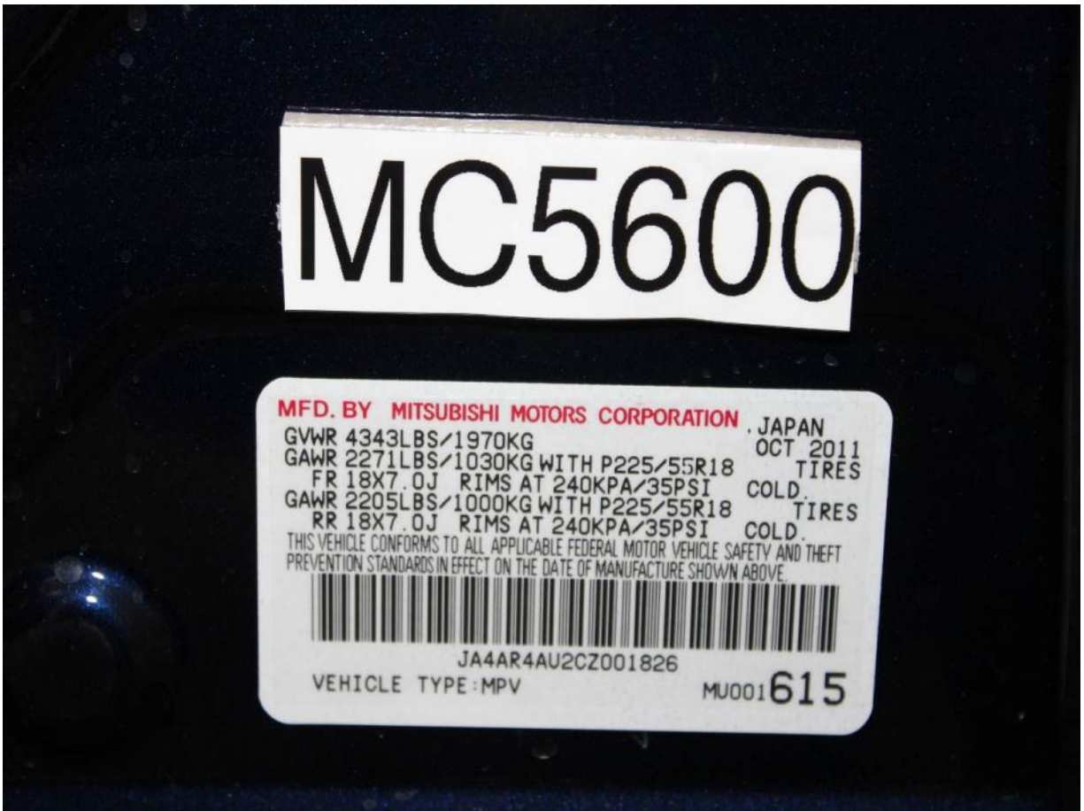
Vehicle Certification Placard