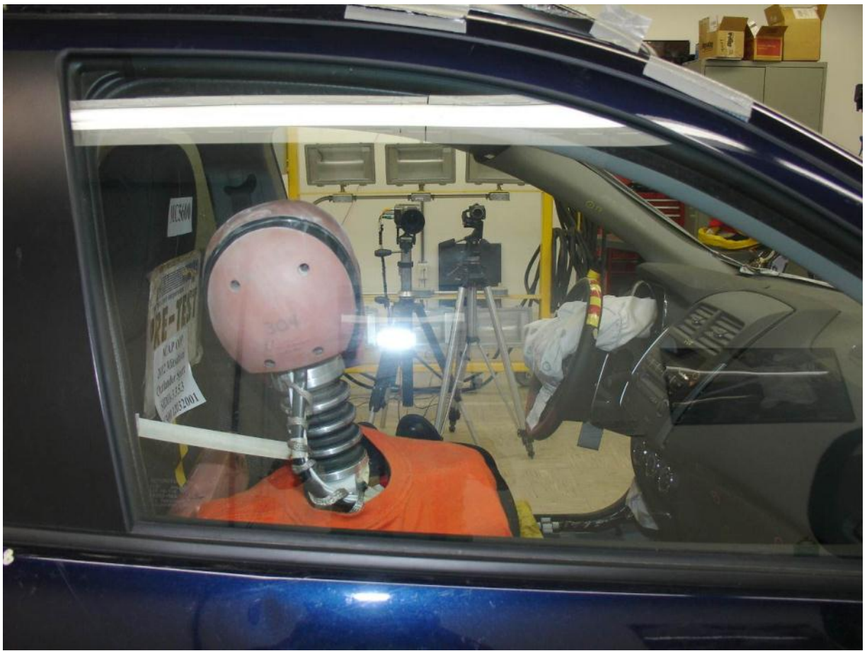
Pre-Test SID-IIs Dummy Right Side View