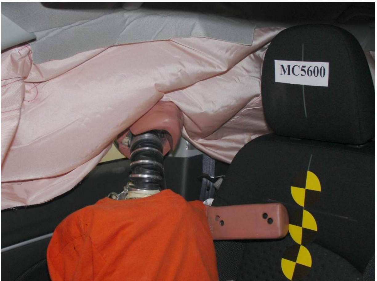
Post-Test SID-IIs Dummy Left \frac{3}{4} Front Closeup View