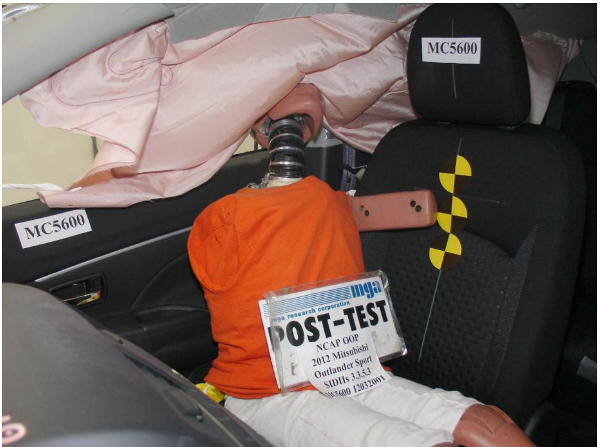
Post-Test SID-11s Dummy Left 3/4 Front View