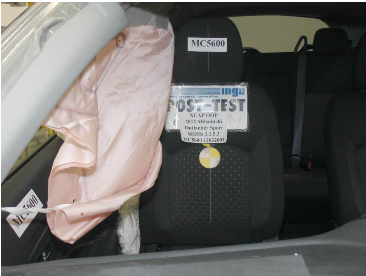
Post-Test Curtain Airbag Front View