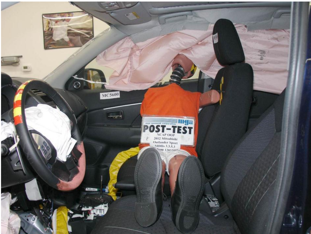
Post-Test SID-IIs Dummy Left Side View