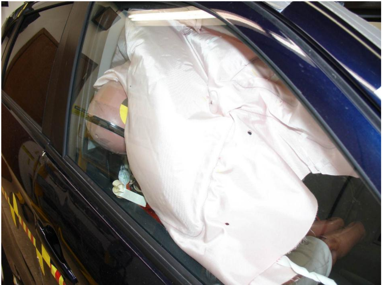
Post-Test SID-IIs Dummy Right ¾ Front View