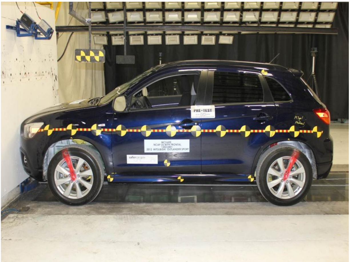
Pre-Test Vehicle Left Side View