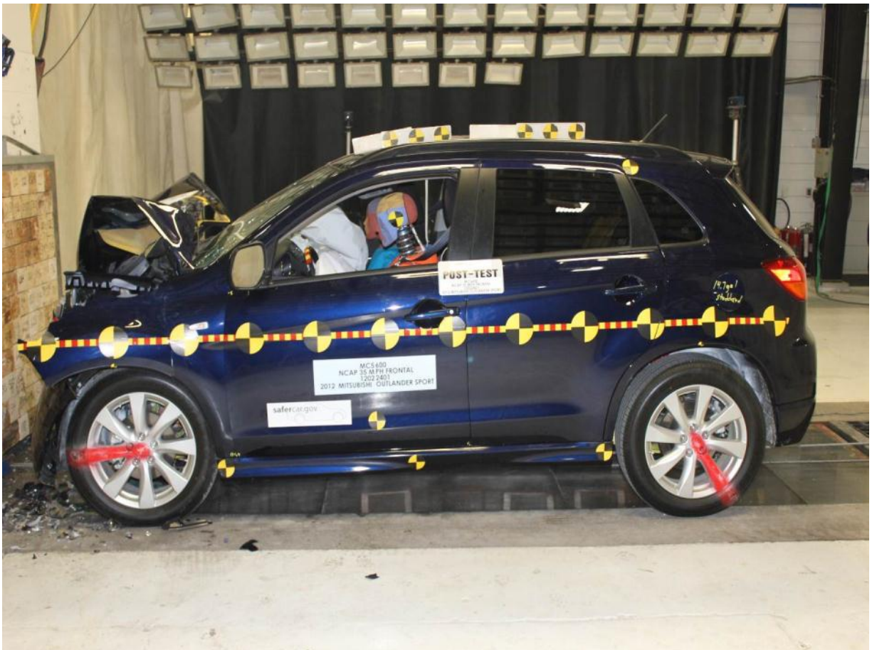
Post-Test Vehicle Left Side View