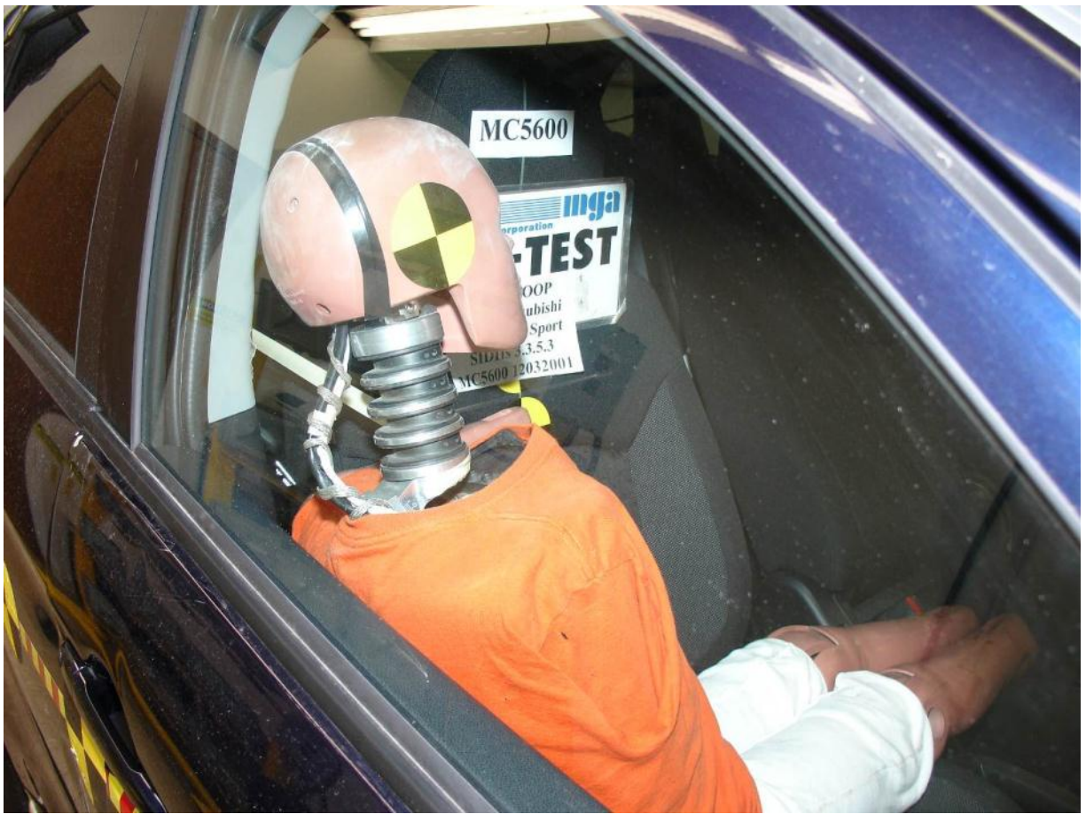
Pre-Test SID-IIs Dummy Right ¾ Front View