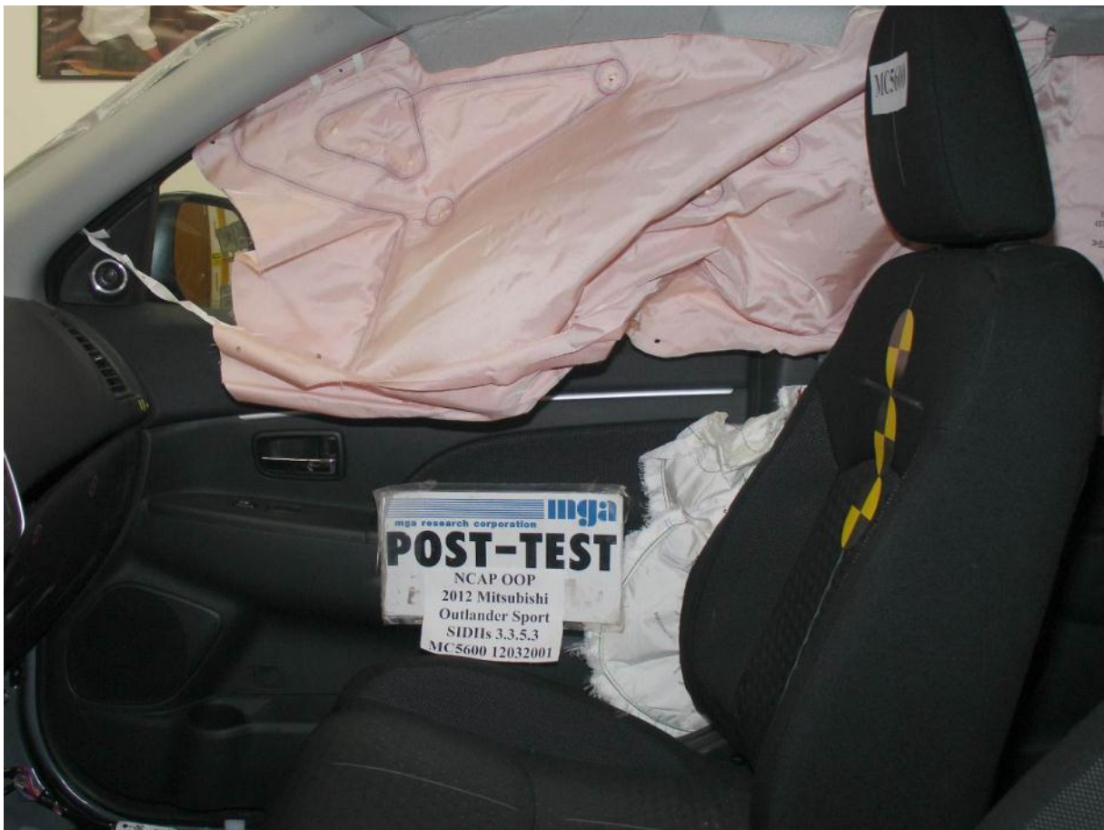
Post-Test Curtain Airbag Left Side View