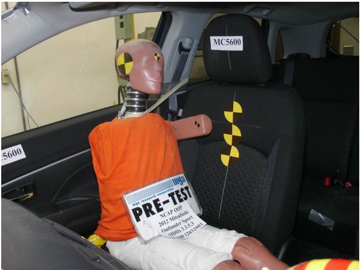
Pre-Test SID-11s Dummy Left 3/4 Front View