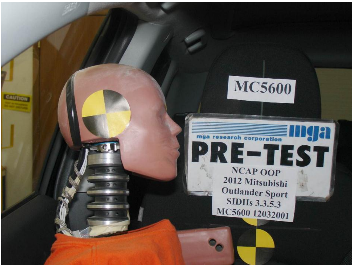
Pre-Test SID-IIs Dummy Front Closeup View