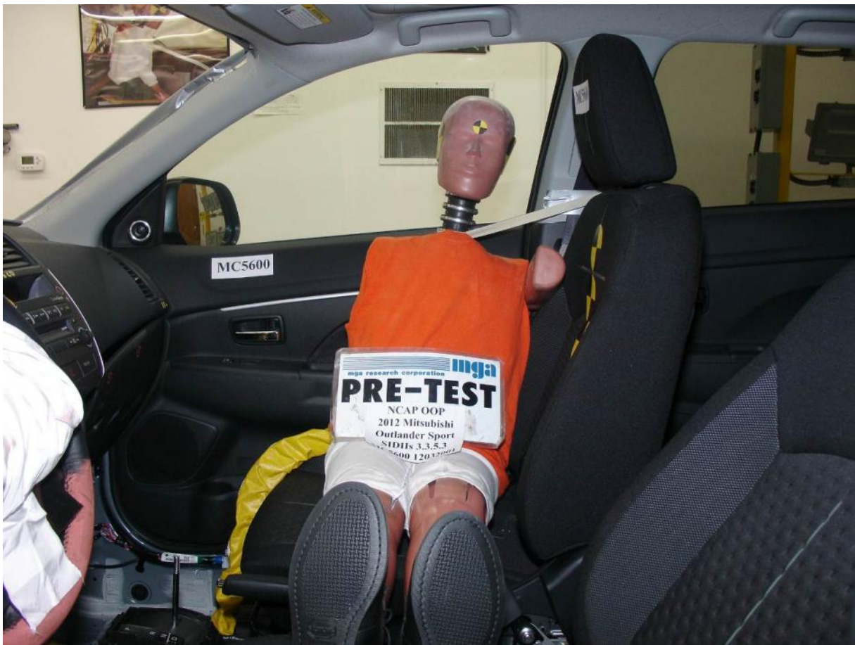
Pre-Test SID-IIs Dummy Left Side View