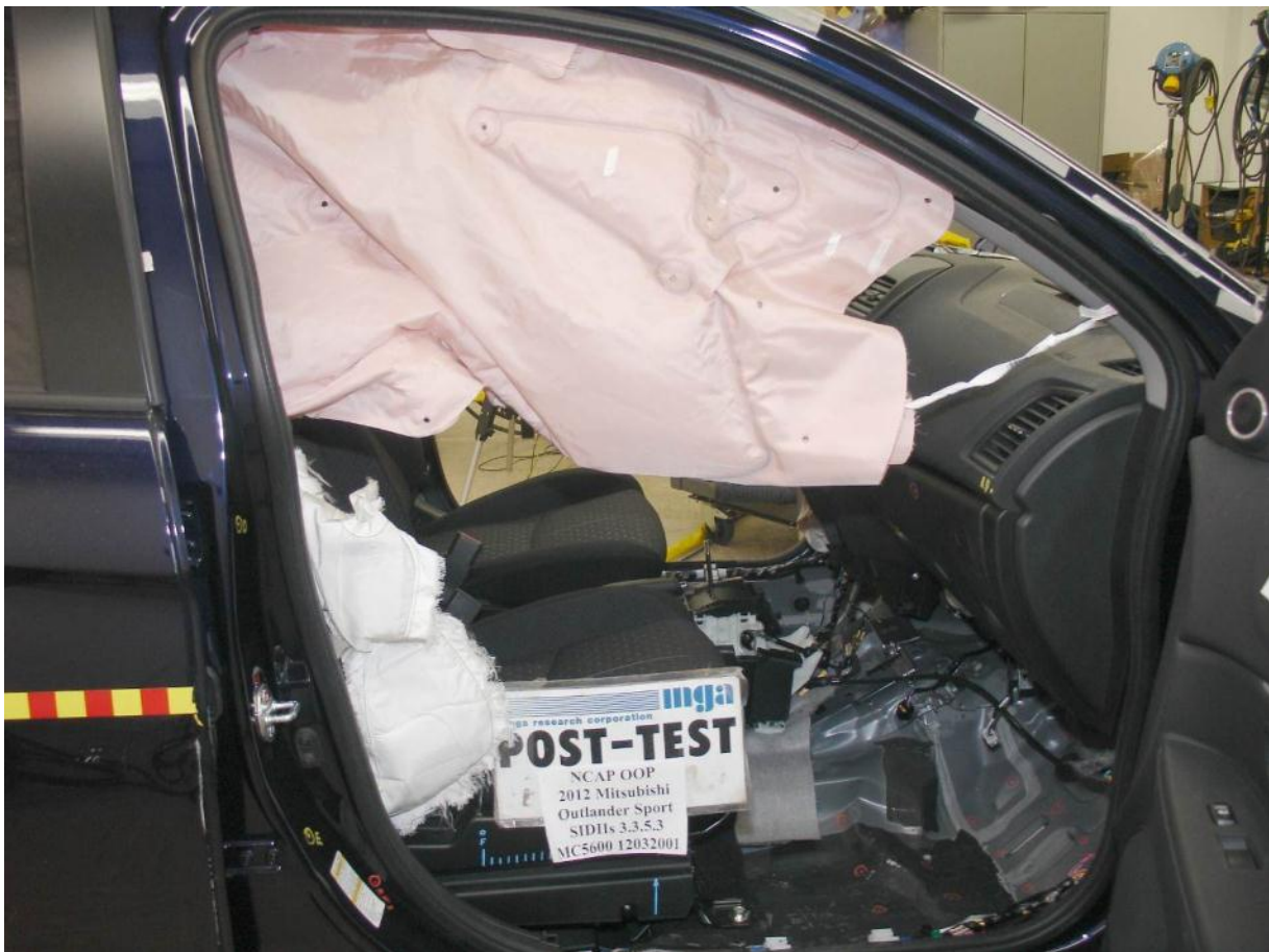
Post-Test Curtain Airbag Right Side View (Door Open)