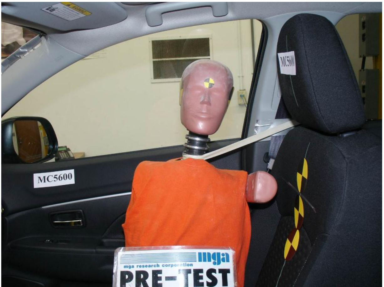
Pre-Test SID-IIs Dummy Left Side Closeup View