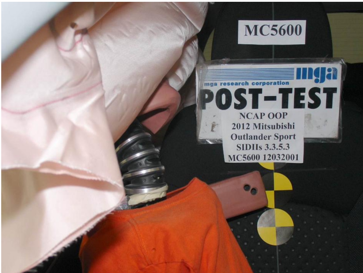
Post-Test SID-IIs Dummy Front Closeup View