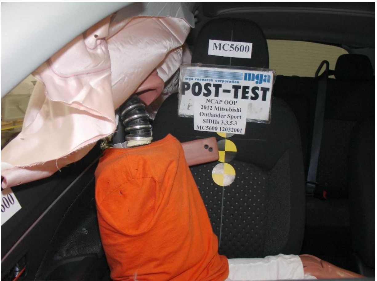
Post-Test SID-IIs Dummy Front View