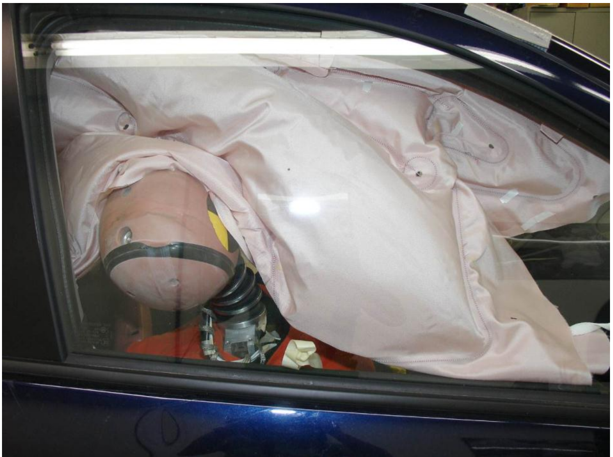
Post-Test SID-IIs Dummy Right Side View